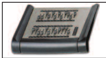
MENTOR Extension Wing